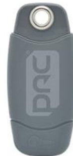
PAC OPS™ no clip