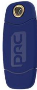
PAC OPS™ Lite with clip