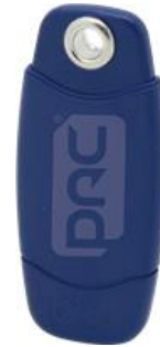
PAC OPS™ Lite no clip