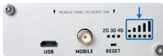
Signal strength LEDs

The table below shows the description of the LED combinations: