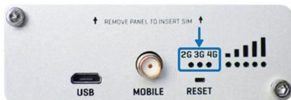
Network type LEDs