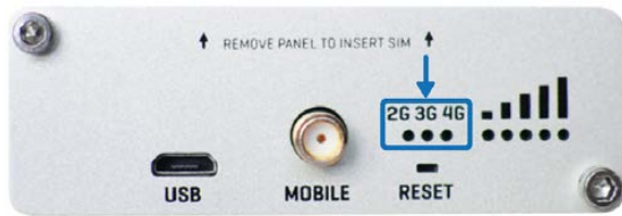
Network type LEDs