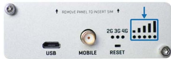
Signal strength LEDs

The table below shows the description of the LED combinations: